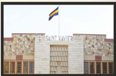
St. Xavier's School, Jaipur