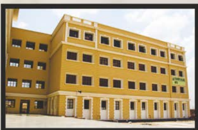
St. Xavier's College, Nevta