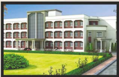
St. Xavier's School, Mahua