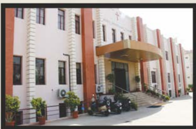
St. Xavier's College, Jaipur