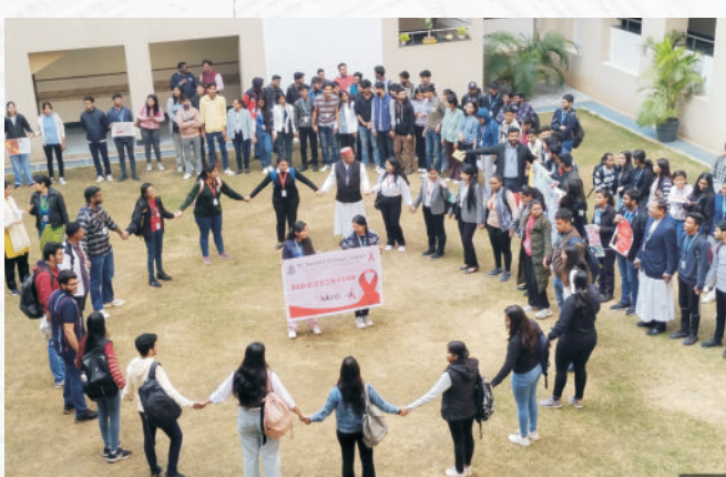
Human Chain by college students on World AIDS Day, 1 December 2023