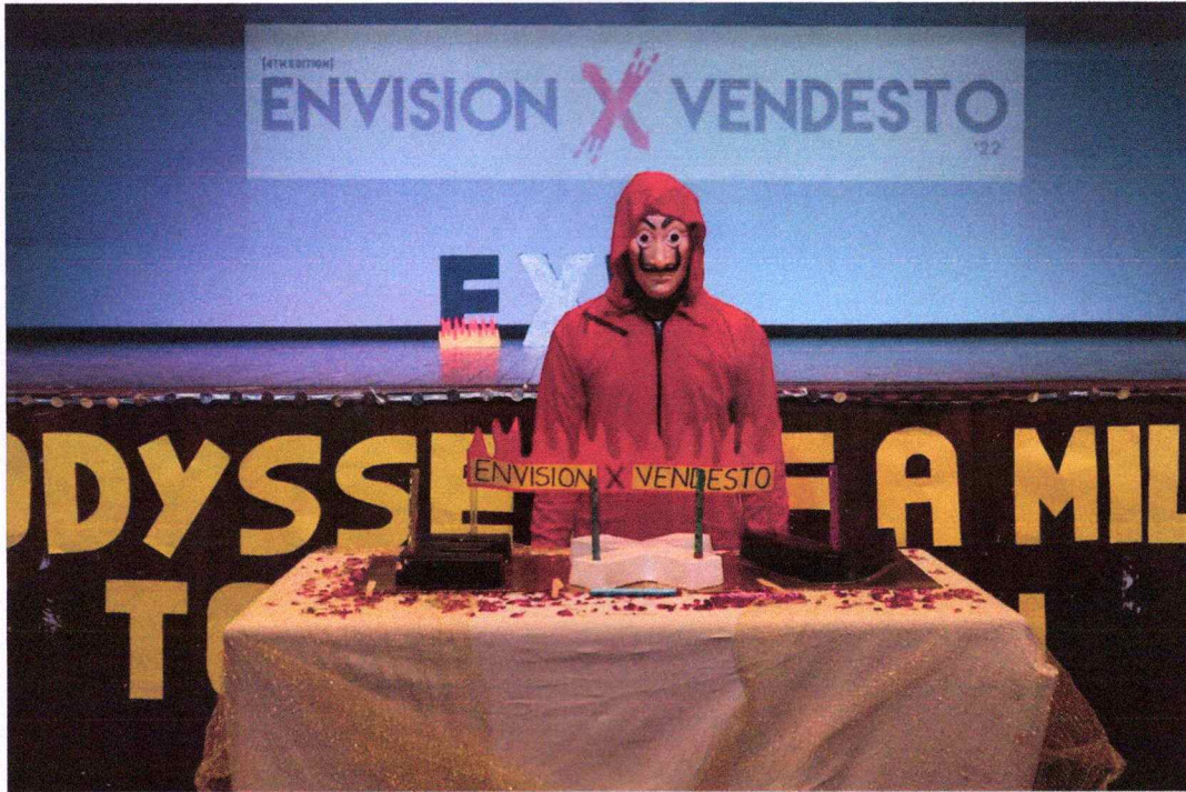
Criteria 3/Department of Business Administration, Department of Commerce/Envision X Vendesto 2022/17th November to 18th January 2022