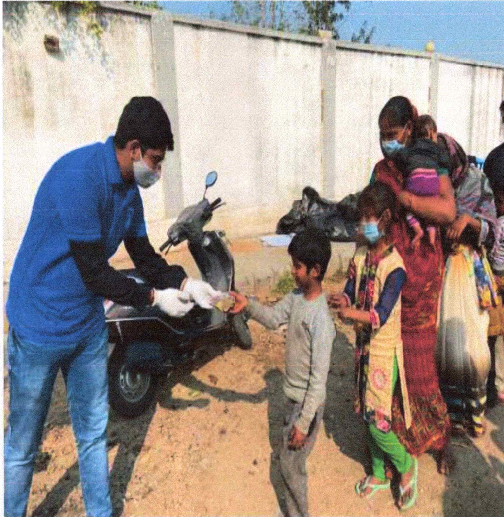
Criterion 3/AICUF/ Food Donation Drive/ 26 December 2020