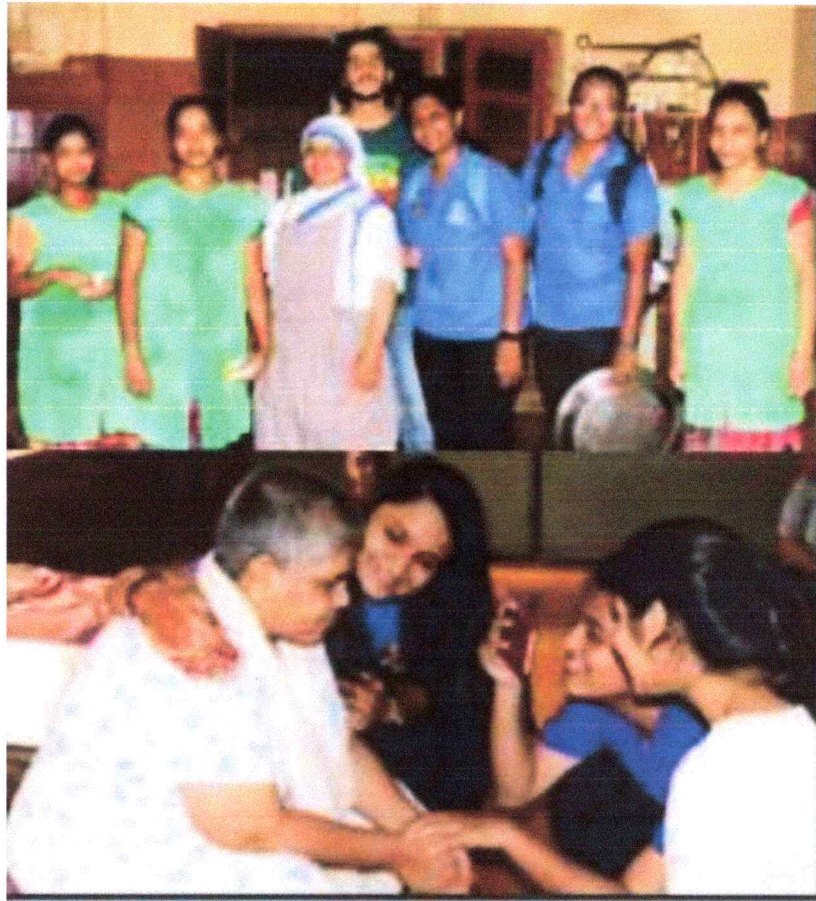
Criteria 3/ AICUF/ Visit to Mother Teresa Home/ 21 September 2018