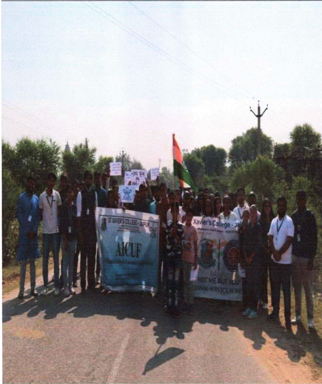
Criterion 3/ AICUF/ National Unity Day/ 31 October, 2022