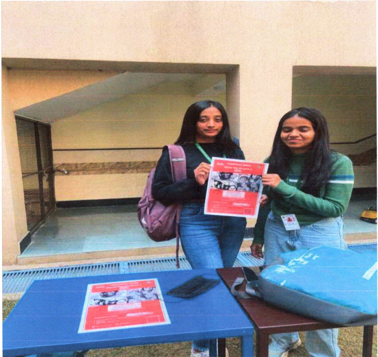
Criteria 3/ AICUF/ Fund Raising Carnival/ 21 to 22 December 2022