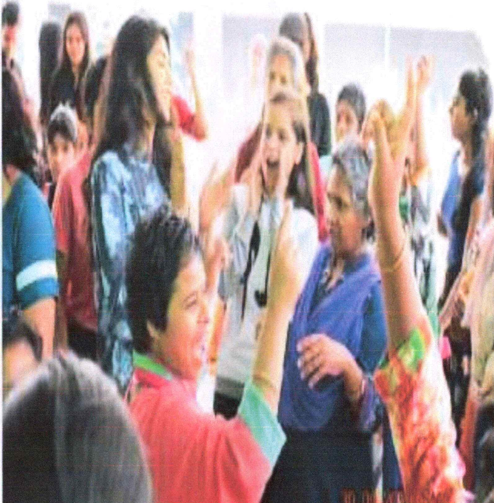
Criterion 3/ AICUF/ Orphanage and Old Age Home Visit / 30 September 2019