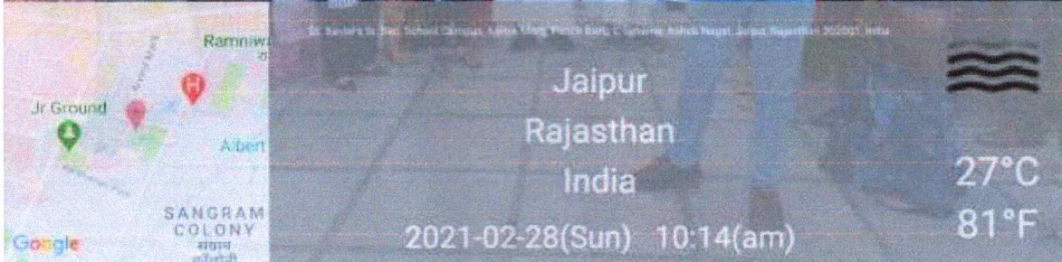
Criterion 3/ AICUF/ COVID 19 Relief Package Drive/ 28 February 2021