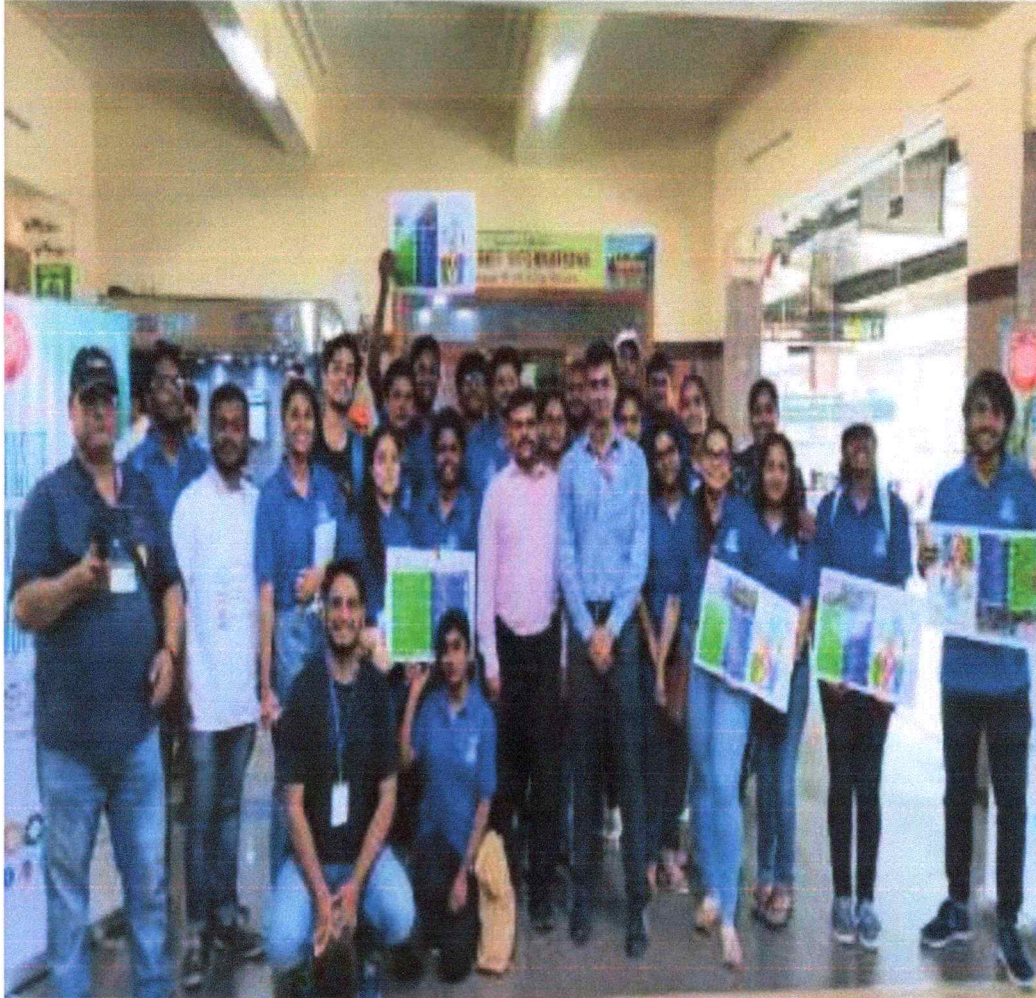
Criterion 3/ AICUF/Waste Warriors/ 2 October 2019