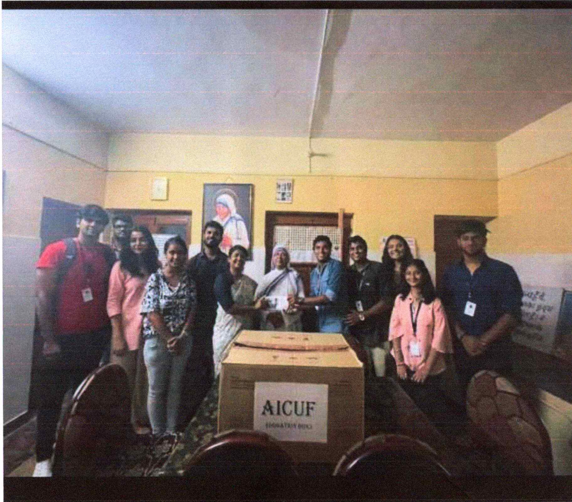
Criterion 3/AICUF/ Donation drive to commemorate International Day of Peace/ 21 September, 2022