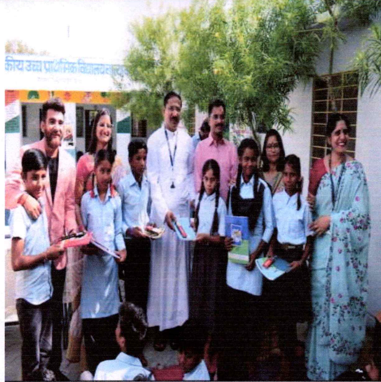
Criteria 3/ Department of English Enlightened Echelon and All About Happiness / Syaahi , the stationery donation drive/ 9 September, 2023