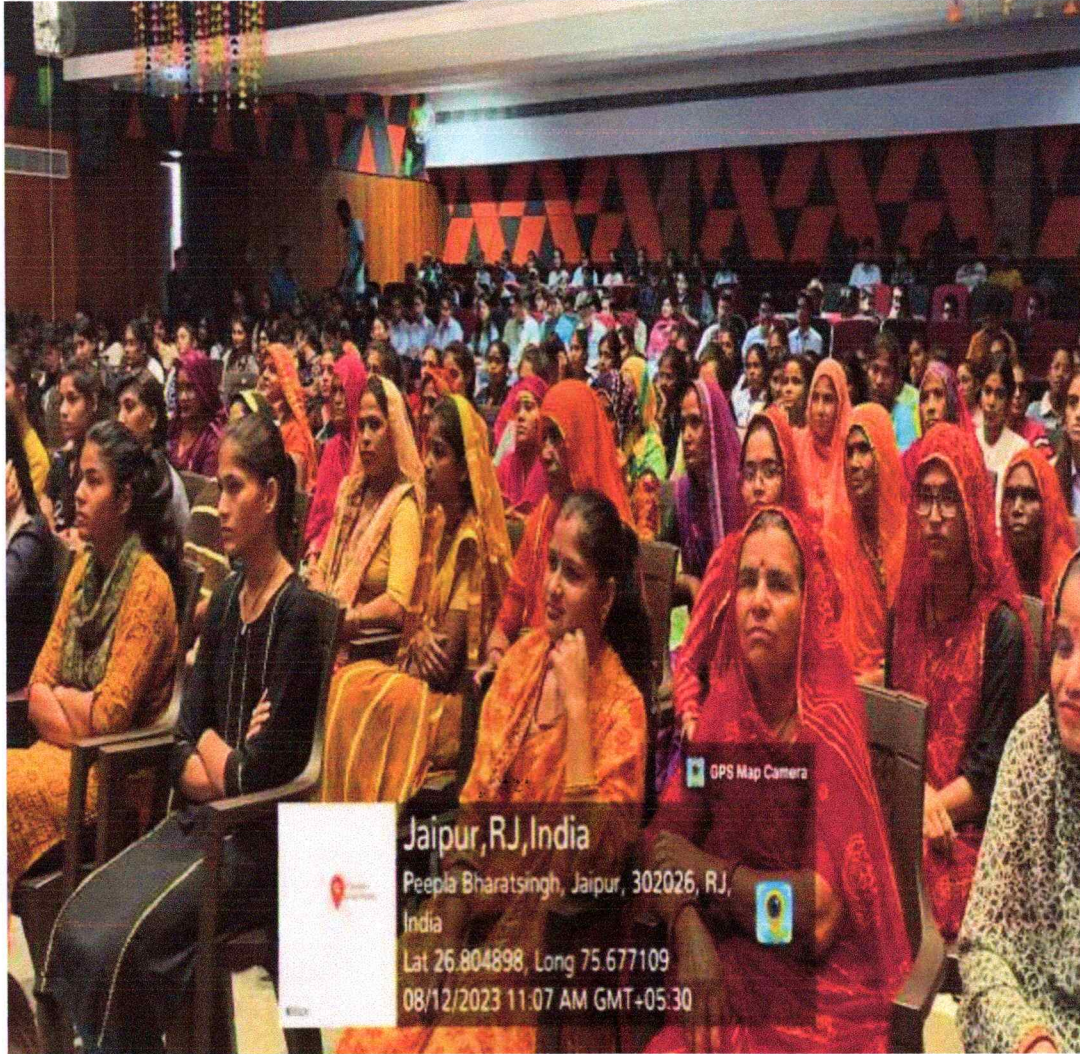
Criterion 3/Department of Arts, IQAC, XELC, Election Department of Rajasthan/Hands-on training on Voter id Application App by Election Department of Rajasthan/ 12/08/2023