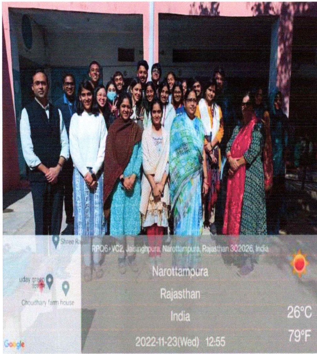
Criteria 3/ Department of Economics/ Donation drive/ 23-11-22