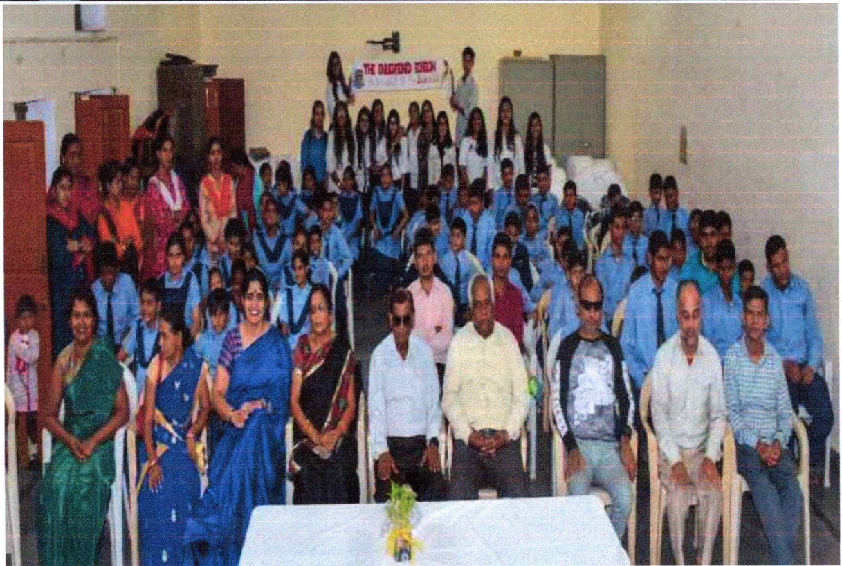
Criterion 3/ Department of English/ Visit to blind school/ 14 Nov. 2018