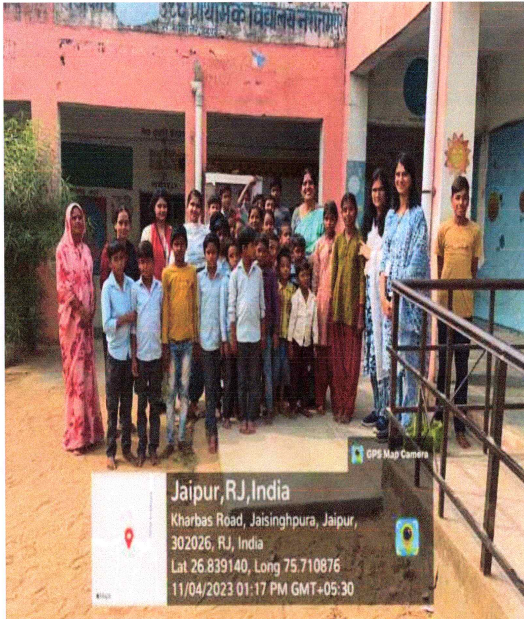
Criteria 3/ Department of Psychology/ Perinatal Healthcare / 4th of November, 2023