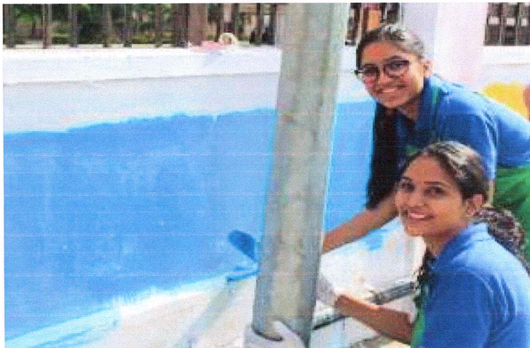
Criterion 3/Department of Business Administration/ Rang De Jaipur / 4 October 2019