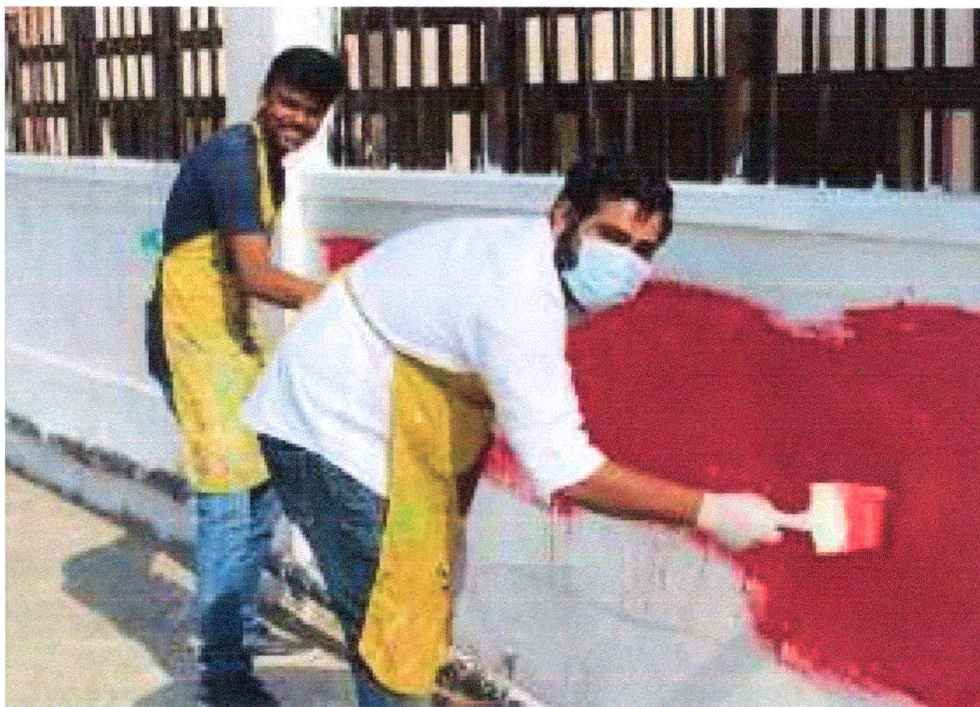
Criterion 3/Department of Business Administration/ Rang De Jaipur / 4 October 2019