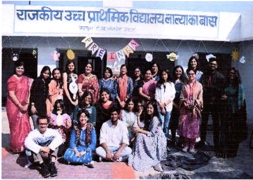
Criteria 3/ Department of English/ Pre - INKA Donation Drive/ 14 November 2022