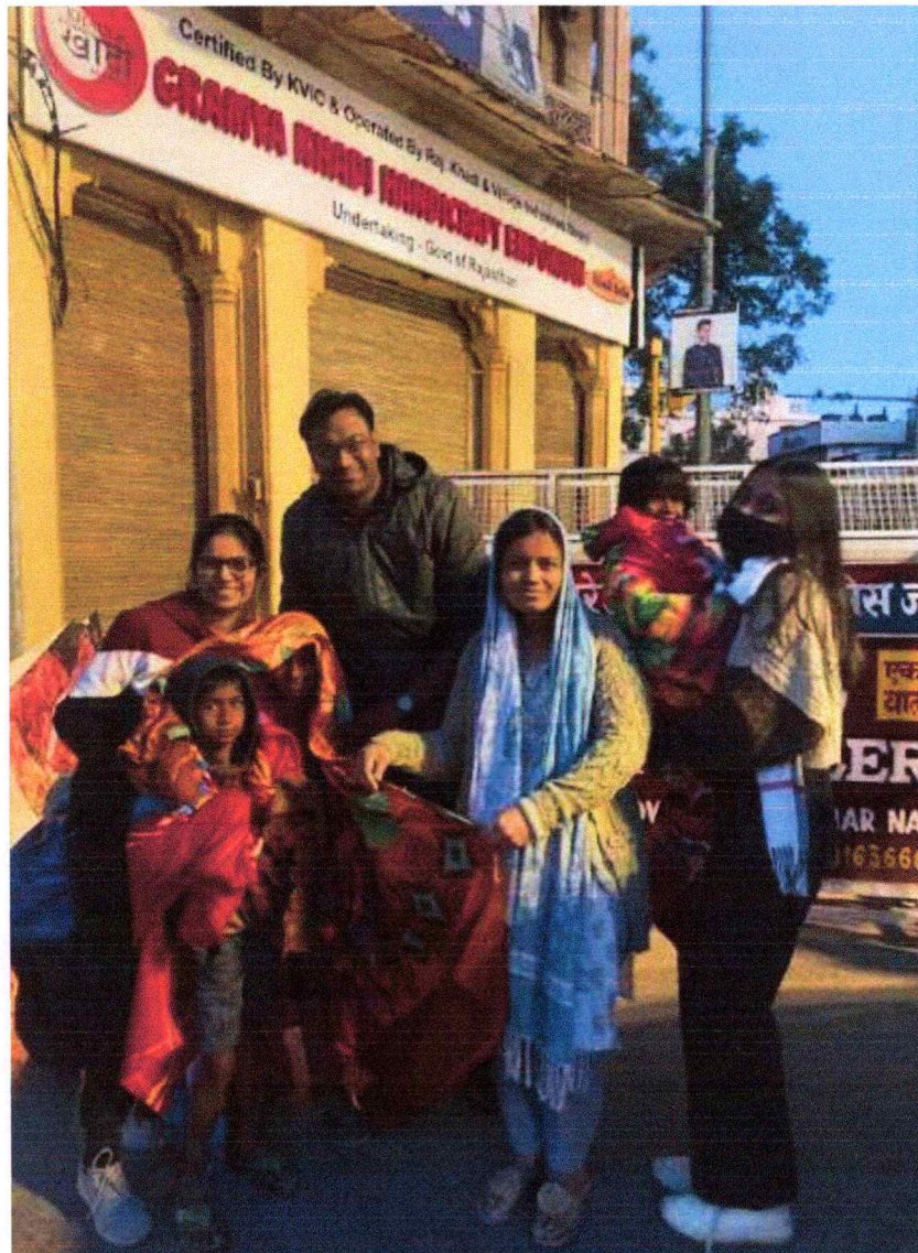
Criterion 3/ Department of English/ Donation Drive- Share the Warmth/ 25 December 2022