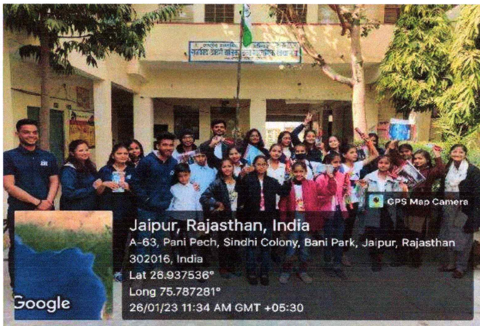
Criterion 3/ Department of English/ Donation Drive-Syaahi/ 25 to 26 January 2023