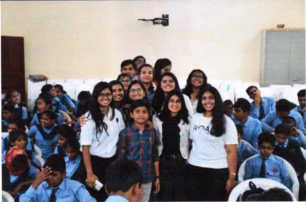
Criterion 3/ Department of English/ Visit to blind school/ 14 Nov. 2018