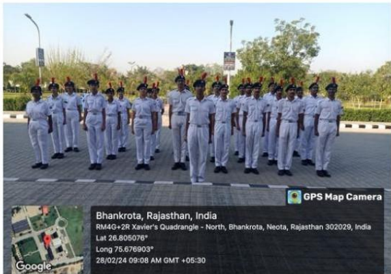
GPS Map Camera Bhankrota, Rajasthan, India RM4G+2R Xavier's Quadrangle - North, Bhankrota, Neota, Rajasthan 302029, India Lat 26.805076° Long 75.678903° 28/02/24 09:08 AM GMT +05:30