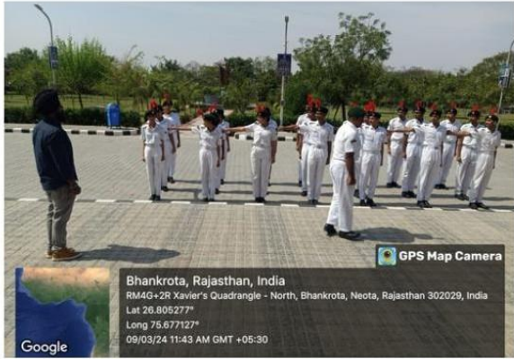
GPS Map Camera Bhankrota, Rajasthan, India RM4G+2R Xavier's Quadrangle - North, Bhankrota, Neota, Rajasthan 302029, India Lat 26.805277° Long 75.677127° 09/03/24 11:43 AM GMT +05:30