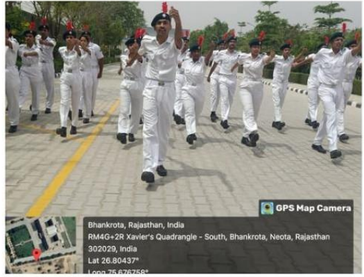
GPS Map Camera Bhankrota, Rajasthan, India RM4G+2R Xavier's Quadrangle - South, Bhankrota, Neota, Rajasthan 302029, India Lat 26.80437° Long 75.676756°