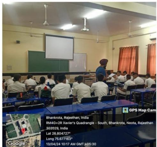
GPS Map Camera Bhankrota, Rajasthan, India RM4G+2R Xavier's Quadrangle - South, Bhankrota, Neota, Rajasthan 302029, India Lat 26.804727° Long 75.677163° 13/04/24 10:17 AM GMT +05:30