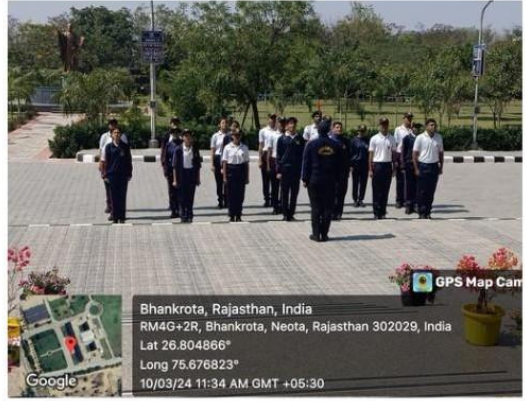
GPS Map Camera Bhankrota, Rajasthan, India RM4G+2R, Bhankrota, Neota, Rajasthan 302029, India Lat 26.804866° Long 75.676823° 10/03/24 11:34 AM GMT +05:30