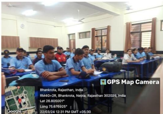
GPS Map Camera Bhankrota, Rajasthan, India RM4G+2R, Bhankrota, Neota, Rajasthan 302029, India Lat 26.805001° Long 75.676925° 22/03/24 12:31 PM GMT +05:30