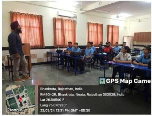
GPS Map Camera Bhankrota, Rajasthan, India RM4G+2R, Bhankrota, Neota, Rajasthan 302029, India Lat 26.805001° Long 75.676925° 22/03/24 12:31 PM GMT +05:30