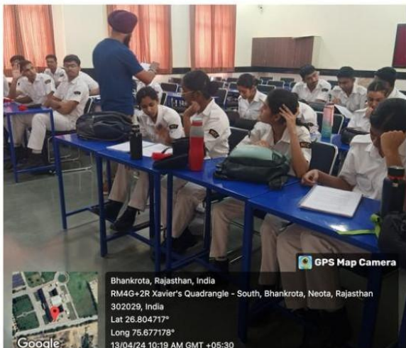
GPS Map Camera Bhankrota, Rajasthan, India RM4G+2R Xavier's Quadrangle - South, Bhankrota, Neota, Rajasthan 302029, India Lat 26.804717° Long 75.677178° 13/04/24 10:19 AM GMT +05:30