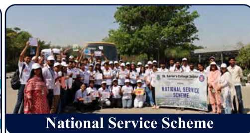
National Service Scheme