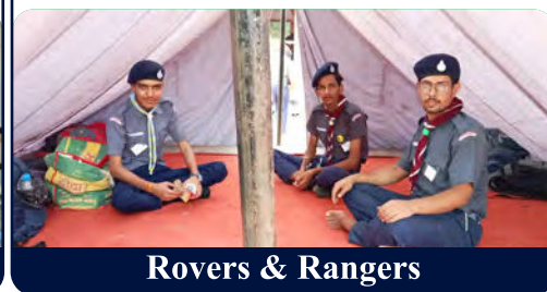
Rovers & Rangers