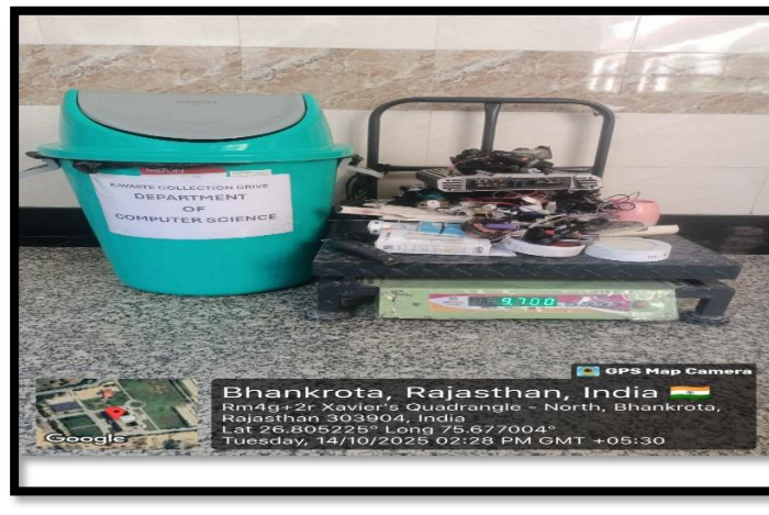
Figure 1: Collected e-waste weighing 9.700 kg during the E-Waste Collection Drive (1–14 October 2025), organized by the Department of Computer Science.