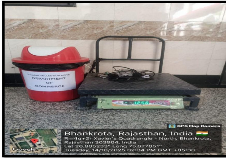
Figure 3: Collected e-waste weighing 1.250 by the Department of Commerce