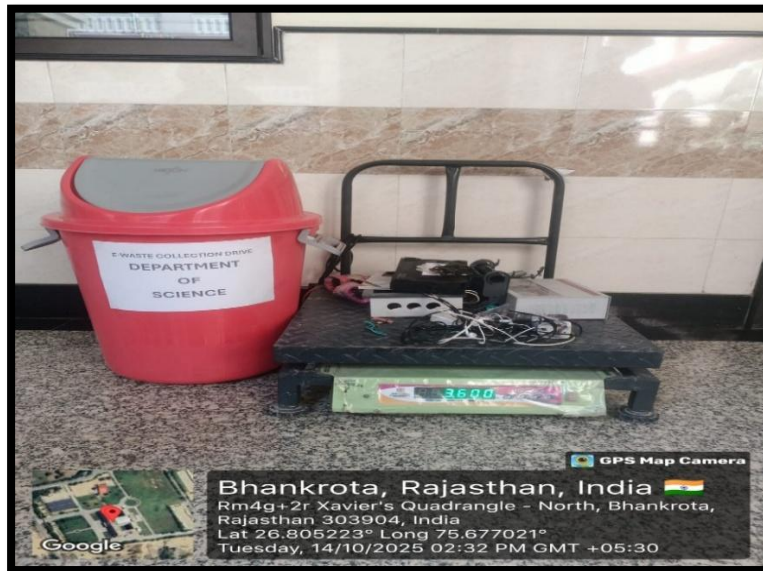
Figure 4: Collected e-waste weighing 3.600 kg by the Department of Science