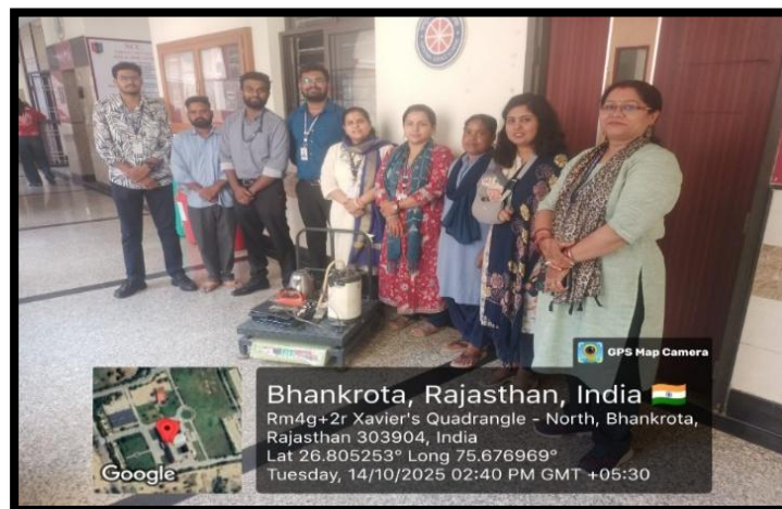
Figure 2: Faculty members associating in the successful handover of collected e-waste during the E-Waste Collection Drive on 14 October 2025.