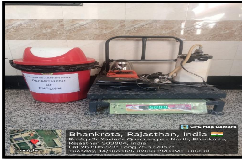
Figure 5: Collected e-waste weighing 5.000 kg by the Department of English.